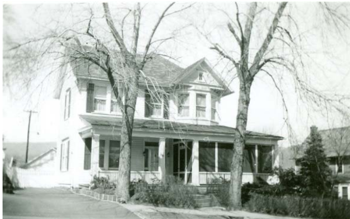
In 1931 – Prior to his Governorship, John S. Fine purchased and lived in this house on 76 West Main Street in Nanticoke.